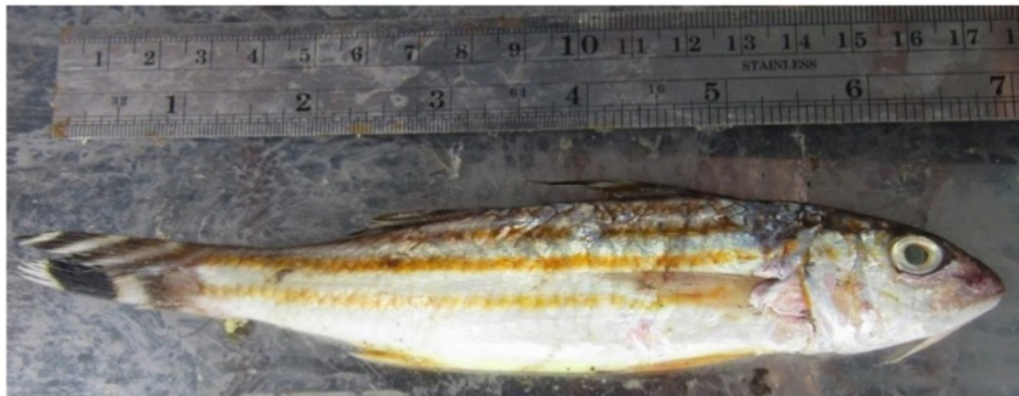
Figure 2. Upeneus moluccensis

Of the 38 fish species found at the 7 mangrove sampling stations, 20 species were economically important fishes. These were: Upeneus moluccensis Bleeker 1855 (Figure 2), (2) Epinephelus fuscoguttatus Forsskål 1775, (3) Cromileptes altivelis Valenciennes 1828, (4) Lates calcarifer Bloch 1800, (5) Psammoperca waigiensis Cuvier 1828, (6) Lutjanus bitaeniatus Valenciennes 1830, (7) Siganus canaliculatus Park 1797, (8) Siganus javus Linnaeus 1766, (9) Stegostoma fasciatum Hermann 1783 (Figure 3), (10) Synanceia verrucosa Bloch & Schneider 1801, (11) Carangoides malabaricus Bloch & Schneider 1801, (12) Lethrinus lentjan Lacepède 1802, (13) Pomadasy maculatus Bloch 1793, (14) Scarus frenatus Lacepède 1802, (15) Chanos chanos Forsskål 1775, (16) Mugil cephalus Linnaeus 1758, (17) Scylla serrata Forsskål 1775, (18) Portunus pelagicus Linnaeus 1758, (19) Penaeus merguensis De Man 1907, and (20) Panulirus versicolor Latreille 1804.