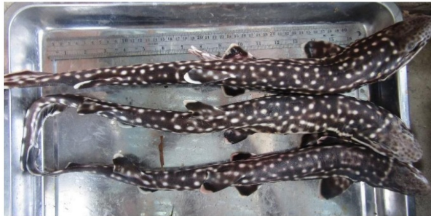
Figure 3. Stegostoma fasciatum

The correspondence analysis (Figure 4) indicated that mangrove locations characterised by dominant mangrove species Bruguiera parviflora , Avicennia alba , Bruguiera gymnorrhiza , Ceriops tagal , moderate values of the Shannon diversity index ( 1 < H' \leq 3 ), and moderate values of the Simpson dominance index ( 0.5 < C \leq 0.75 ) were associated with the economically important fish species Psammoperca waigiensis , Synanceia verrucosa and Pomadasys maculatus . This association was thought to be influenced by the role of Bruguiera parviflora and Avicennia alba in reducing current velocity with a dense root system which provided habitat favoured by Psammoperca waigiensis . Pomadasys maculatus . These two fishes area generally found in coastal waters, seeking crustaceans and small fish as food.